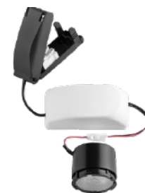
Driver included with all modules

Easy to replace like a light bulb, but technically versatile and therefore suitable for all applications.